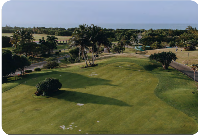
Havana's eastern beaches.

Generally speaking, the most visited tourist areas in the city are Havana's eastern beaches, Havana's colonial downtown and Monte-Barreto-Vedado.