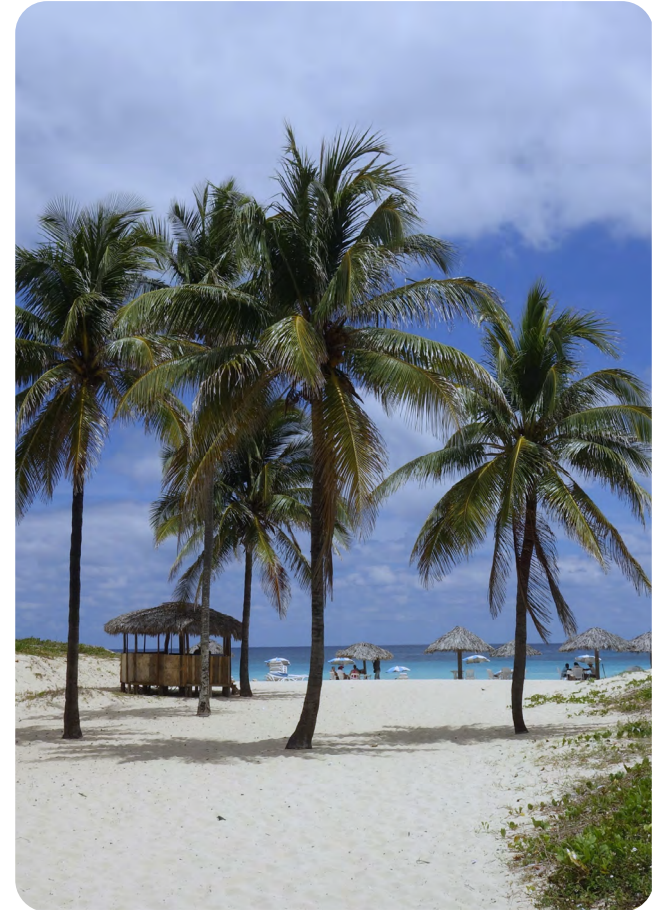
Havana's eastern beaches.