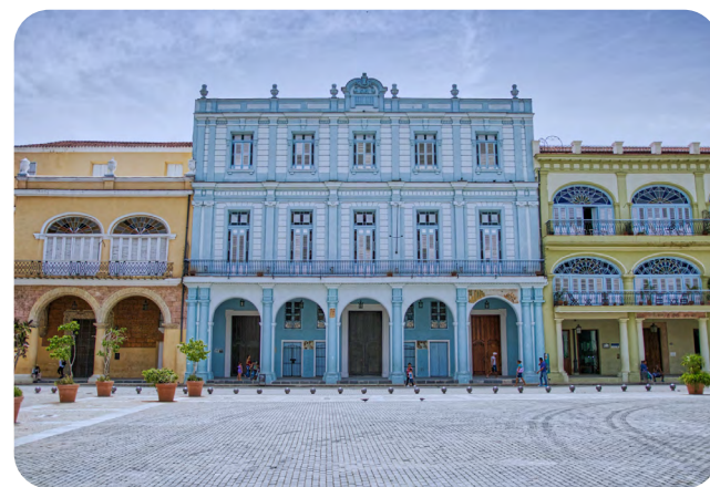
‘Plaza Vieja’.

of several Party congresses as well as several international events; meetings in solidarity with fraternal peoples; celebration of anniversaries of the attack on the Moncada Garrison; the commemoration of the triumph of the Cuban Revolution and other important celebrations, including general meetings with the Cuban people; combatant people’s parades; workers’ parades; military parades; students’ parades; students’ graduation ceremonies; pioneer children initiation ceremonies; solemn activities and eulogies.