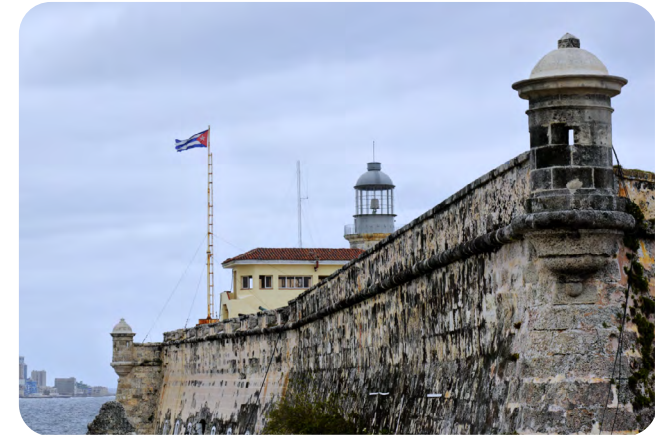
'San Carlos de la Cabaña' Fortress.

'San Carlos de la Cabaña' Fortress: It stands to the east of Havana's harbor. 'La Cabaña' was the biggest fortress built by Spain in the Americas after the British invasion of Havana. It was concluded by the end of the eighteenth century. Nowadays, it has become the main venue of Havana's International Book Fair and Havana's Arts Biennial. The cannon-shot ceremony takes place on its premises every single day at 9:00pm. It is now a colorful show, but originally it was the official notice advising city dwellers and visitors that, as from that moment, they should remain inside the thick walls that extended for thousands of kilometers around the village to safeguard it from corsairs and pirates attacks.